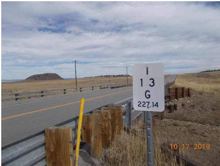
View of bridge I-13-G looking northeast with bridge signage.