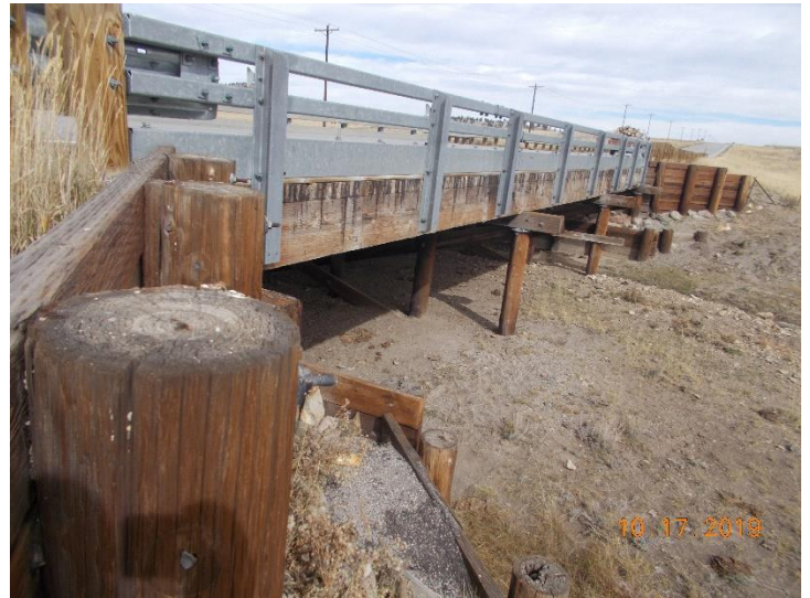
View of the south side of bridge I-13-G.